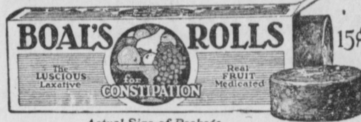
Actual Size of Package

BOAL'S ROLLS CORP., 214-216 W. 14th St., New York