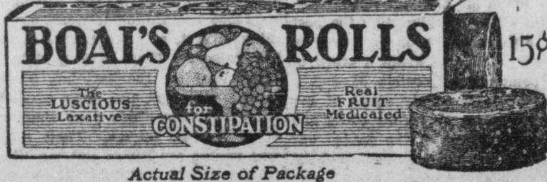
Actual Size of Package

BOAL'S ROLLS CORP., 214-216 W. 14th St., New York