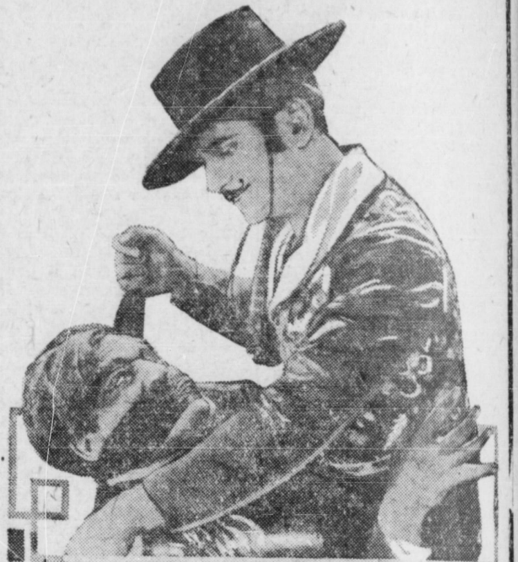
DOUGLAS FAIRBANKS in "DON Q, SON OF ZORRO"

A tender and sweetly romantic story that flows swiftly and surely but is coupled with humor that neither youth nor age can resist. The dashing Don Q bars all worry and you will live in laughs and thrills.