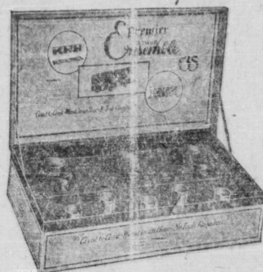
The Premier "Ensemble" in Beautiful, Attractive Three-Color Display Carton