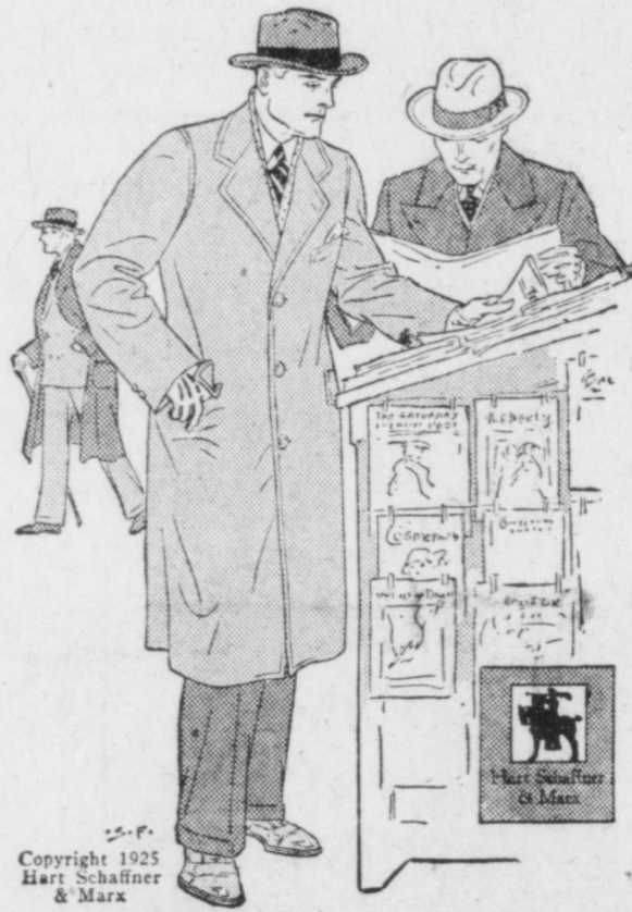
Copyright 1925 Hart Schaffner & Marx

For strained eyes try simple hydragris, boric, etc., as mixed in Lavoptik eye wash. One small bottle helps any case of weak, strained or sore eyes. It will surprise you. Aluminum eye cup free. SMITH, YAGER & FALK.