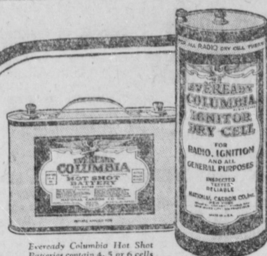
Eveready Columbia Hot Shot Batteries contain 4, 5 or 6 cells in a neat, water-proof steel case.