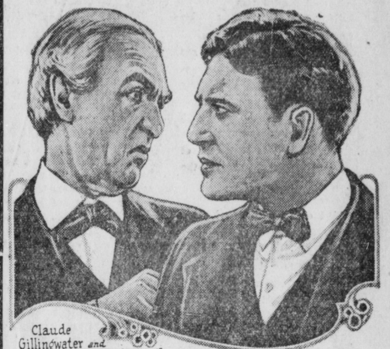
Claude Gillingwater and Richard Dix in Tools First