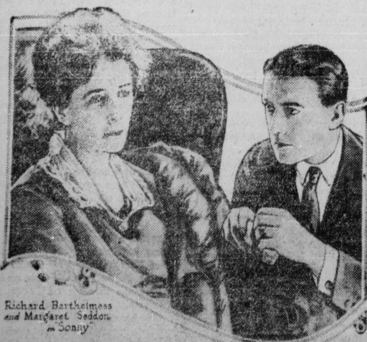
Richard Barthelmess and Margaret Seddon in "Sonny"

A First National in 6 reels featuring RICHARD BARTHELMESS —ADDED ATTRACTION— "TORCHY'S NUT SUNDAY." A clever comedy featuring Johnny Hines