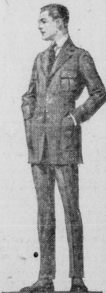
Copyright 1921 Hart Schaffner & Marx

Appreciation of quality is one of the surest evidences of the developed individual. Merely "good enough" is no longer good enough for the man who is growing in his ability to take a constructive place in business or social affairs. The merchandise fostered by this store reflects that policy to the fullest degree. Value can be judged only in relation to quality—in material, in treatment, in form. We never skimp merchandise to fit a price, but build it to express a quality that corresponds to a human need. Our price is determined by the cost of production plus a fair profit—large enough to reward a worthy effort—small enough to win an ever-increasing patronage.