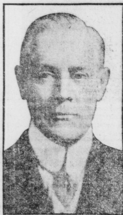
ALBERT J. BEVERIDGE

Former governor of Indiana who was nominated by the democrats as their candidate for United States Senator.