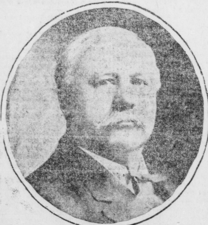
SAMUEL M. RALSTON

Former governor of Indiana who was nominated by the democrats as their candidate for United States Senator.