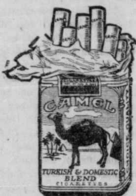
R. J. REYNOLDS Tobacco Co. Winston-Salem, N. C.

But it doesn't take an expert to tell Camel quality. You'll spot it the very first puff. Try Camels yourself.