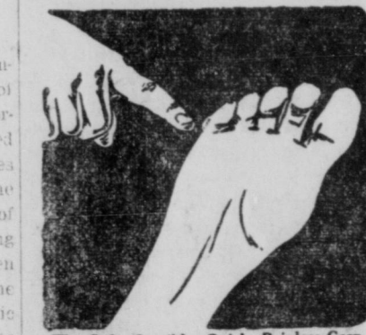
The Safe, Sensible, Quick, Painless Corn Remover—"Gets-It."

Throw away that dangerous razor and plaster. Don't waste your time simply "treating" that pestiferous, itching corn! Get rid of it with "Gets-It." Remove it.