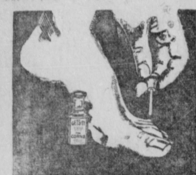
The Only Way to Cure a Corn is to Remove It, with "Gets-It"

Whether your "get" is on top or bottom, inside or out, "gets-it" will remove it from your misery.