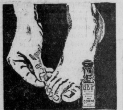
"Peel the Whole Corn Right Off and be Rid of it"

Don't be bossed through life by a pesky corn or callus. Don't let a corn tell you when to sit down. Don't wear shoes too large for you because a corn says you must. Get rid of the darned thing.