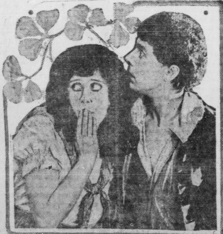
KATHLEEN MAVOURNEEN—WILLIAM FOX PRODUCTION THEDA BARA —in— KATHLEEN MAVOURNEEN A William Fox production of the sweetest Irish drama ever written.

Coming To The Crystal Theatre Monday and Tuesday Matinee and Evening Admission 10 and 25 cents.