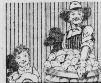
The hired man with shining face Works as though he owned the place. He works all day—his work's well done. He's always happy and full of fun If he only has his—Golden Sun

Discount by paying telephone bills on or before the 10th. Office open till 9 o'clock Saturday, Tuesday and Wednesday evenings. 56-4f