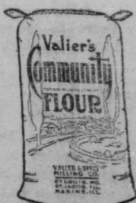
This is Valier's high-grade popular-priced flour—it has made hosts of friends.

Ask your grocer for Valier's Enterprise Flour today.