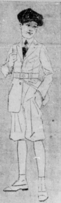
Makers BESTEVE Boys' Clothes