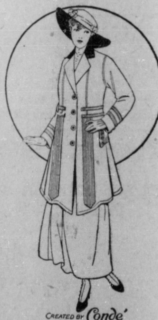
CREATED BY Conde

There's one called the "Carmoor" which partakes of the looseness of the swagger English top coat. All styles and prices from $5.00 up.