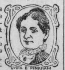
LYDIA E. PINKHAM

If you want special advice write to Lydia E. Pinkham Medicine Co. (confidential) Lynn, Mass. Your letter will be opened, read and answered by a woman and held in strict confidence.