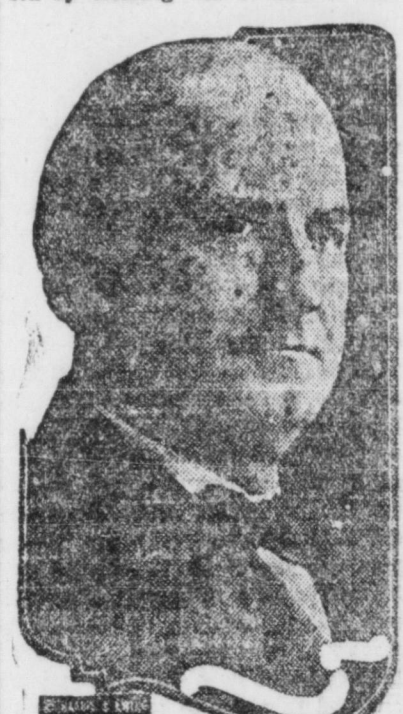
W. J. BRYAN

Indianapolis, Oct. 12.—The "Great Commoner," Wm. J. Bryan, closed a triumphal tour of Indiana in this city Saturday night. Tomlinson Hall was crowded to its capacity, both seating and standing, and thousands were turned away. Bryan is still the idol of Hoosier democracy, and as the years go by that popularity increases as the people understand him better the purity of his motives and his lofty ideals of a government conducted by and for the people as a whole and not for special interests.