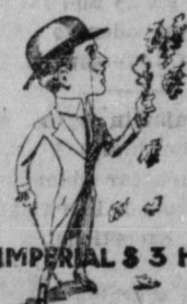
IMPERIAL 3 S HATS

Italy and Turkey are in real war. The first ship was sunk yesterday, Italy being victorious. For a few weeks, at least, blood will run in the foreign lands, and there is a probability that other nations may be mixed into scrimmage before the roses bloom again, although just at present France and Germany seem to be looking toward peace. The Italy-Turkey war came on quickly and as to the merit thereof it is hard to judge. The reputation of Turkey has long been odious, but it is doubtful if even this gives Italy the right to step in and take possession of her property. It looks as though the World's Peace Commission has a job on hands.