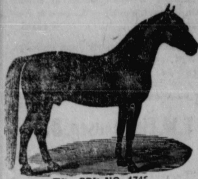
TIP TOP NO. 1745.