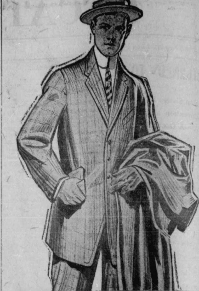
Ederheimer-Stein Young Men's Clothes

W. Wayne Loan Company Established 1895. Room 2 Second Floor, 706 Calhoun Street. Home Phone, 833. Fort Wayne, Ind.