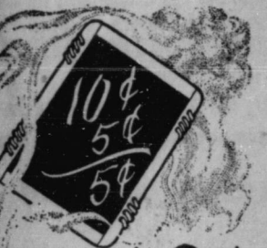
Figure it Out

If you pay 10c for an Imported Havana Cigar you are paying about 5c in Import Duty and the rest for tobacco and manufacture. These are actual facts. Now if you want to save that nickel and at the same time get just as much smoke satisfaction try our "White Stag" cigar. Finer Flavor and More Pleasing in Aroma than any imported cigar at double the price, and you double the purchasing power of your cigar money.