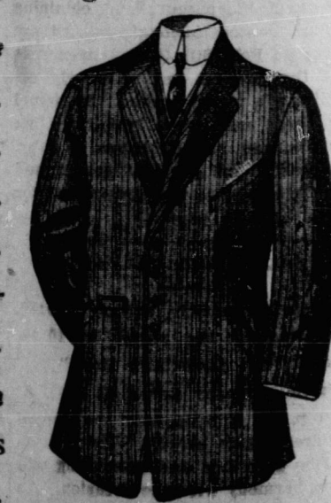
Our Fashion 560 Four-Button Novelty Sack, dip front, perpendicular buttonholes