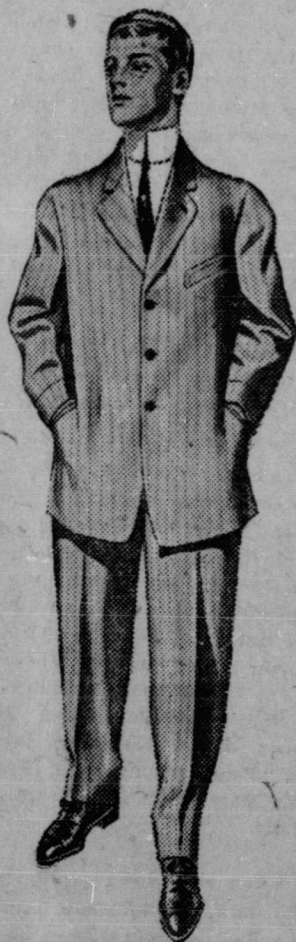
Young Men's Clothes Ederheimer, Stein & Co. - Makers