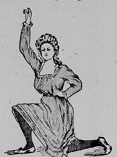
AN EXERCISE FOR GRACE.

A Good Made of Exercise. The exercise illustrated is taken without apparatus. It is useful in the development of a round and beautiful waist and in strengthening the abdominal muscles. It is taken in two positions.