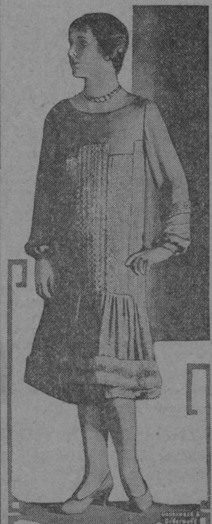
Flared Skirt Model in Velva and Matching Georgette.

For the more elaborate daytime gowns, wraps and ensembles, these couturiers are using all the new rich au-