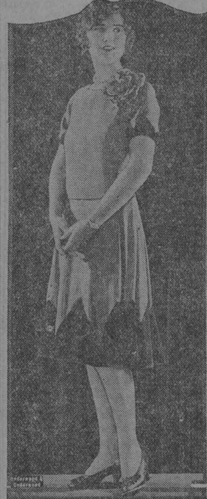
Velvet is the Material of Inset Border and Sleeve Effects.

In making good this claim, Martial et Armand are presenting this season some of the most attractive costumes ever conceived in their atelier. These run through the entire list of the requirements of fashion from the simplest frock for morning or all day, to the most pretentious outfit for afternoon or evening. The fabrics range from the richest velvets and silks, and the most splendid brocades, to plain woolsens and leather. None among the Parisian designers has made more delightful and alluring use of silk velvet, the material de luxe, which fashion prophets and manufacturers of dress goods have long urged upon style lead-